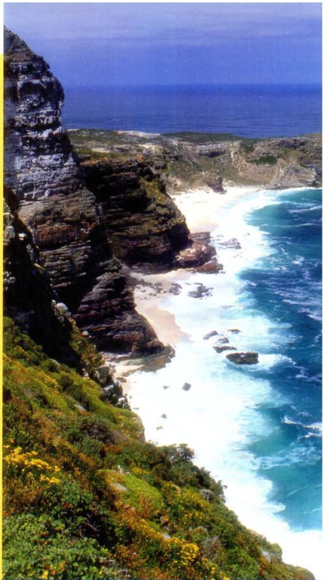
TOP: the view from Cape Point to Cape of Good Hope; BOTTOM: vineyards surround The Winery of Good Hope.