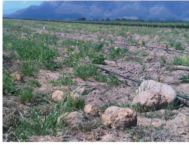
New Chenin Blanc bush vine plantings.