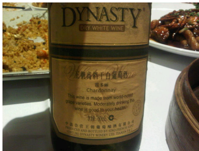
A bottle of Chinese Chardonnay...

Well, Shanghai has 32 million inhabitants, they moved 18 000 families to build the World Expo sight, the bus park takes 2200 buses a day and the traffic through the doors daily is 600 000 people !!! The SA Pavilion sees about 100 000 of this and people were waiting between 3 - 5 hours to come into our pavilion. I have never seen efficiency at this kind of level; it was somehow very refreshing, coming from SA. It would seem that we have a few things to learn from them!