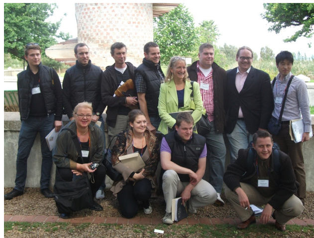
The amazing group of the 12 top sommeliers that competed in the World Cup Sommelier and a WOSA represent in the middle!

An amazing day in the winelands and I was very proud to be a part of the Jury –and the SA wine industry! You can find out more on www.wosa.co.za