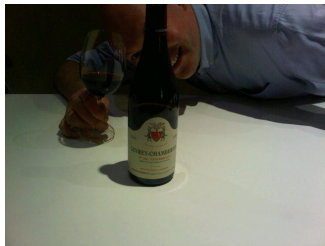
Alex showing off a favorite in a odd way!

If you have the time, please check out PINOSITY.COM is inspired by a persistent curiosity and occasional wild infatuation for Pinot Noir. It presents an online resource for Pinot Noir lovers. Useful information, written with accuracy, intelligence and periodical humor, it attempts to create a global view about this most wonderful, titillating and often frustrating variety. The site is sponsored by Dalrymple but is open to all wineries, regions and enthusiasts who wish to be involved either actively or passively.